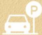
Visitor Car Parking