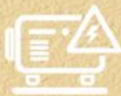
Generator Backup for Common Area Lights +1 Lift