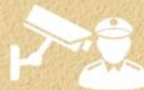
24*7 Security with CCTV Surveillance & Compounded Society