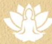
Yoga & Meditation Area