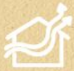
Fully Ventilated Apartments