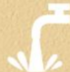
24*7 Water Supply (Corporation & Ground Water)