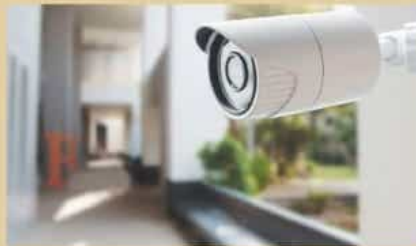
Safe and Secure Life