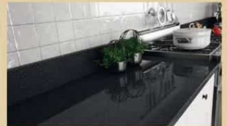
Modern Style Kitchen