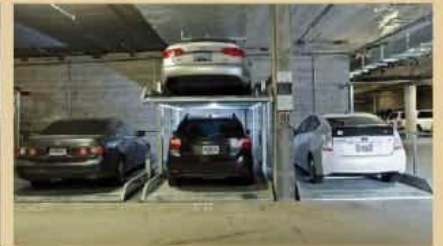
Individual Parking Space