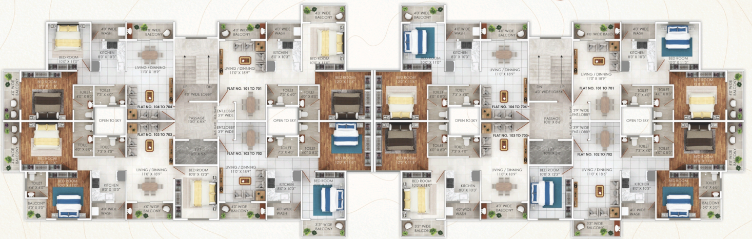
WING - B